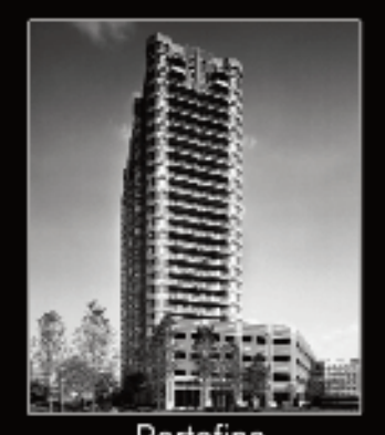
Portofino Jersey City, New Jersey