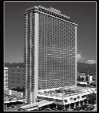
The Ala Moana Honolulu, Hawaii