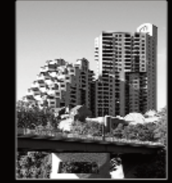
Falls and Pinnacle Minneapolis, Minnesota