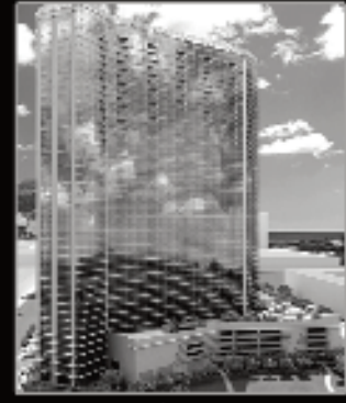
Koʻolani Honolulu, Hawaii