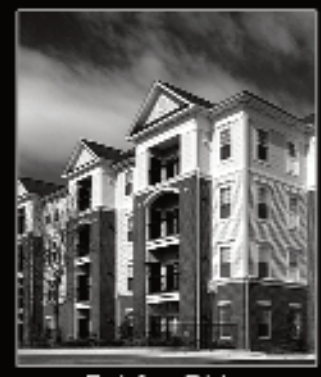
Fairfax Ridge Fairfax, Virginia